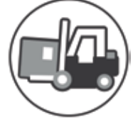
Inventory & Logistics